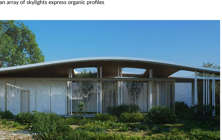
an array of skylights express organic profiles